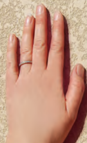
STANDARD BAJA SAND

YES! In the summer months, the Reflecto Seal feels cooler.