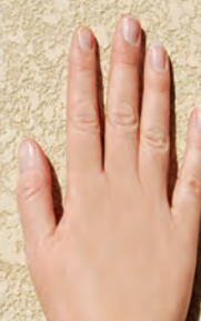
REFLECTO SEAL BAJA SAND